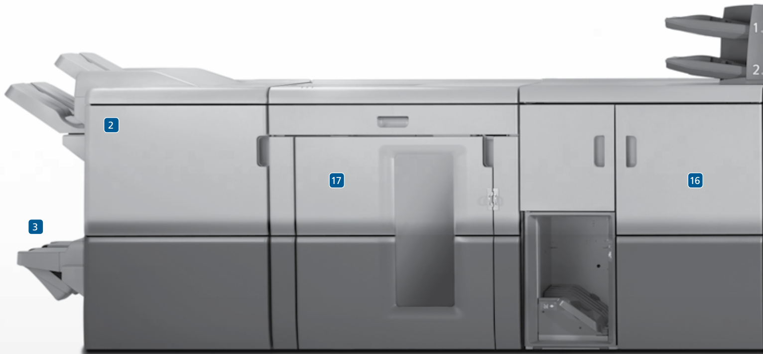
SAVIN Pro 8100 Series